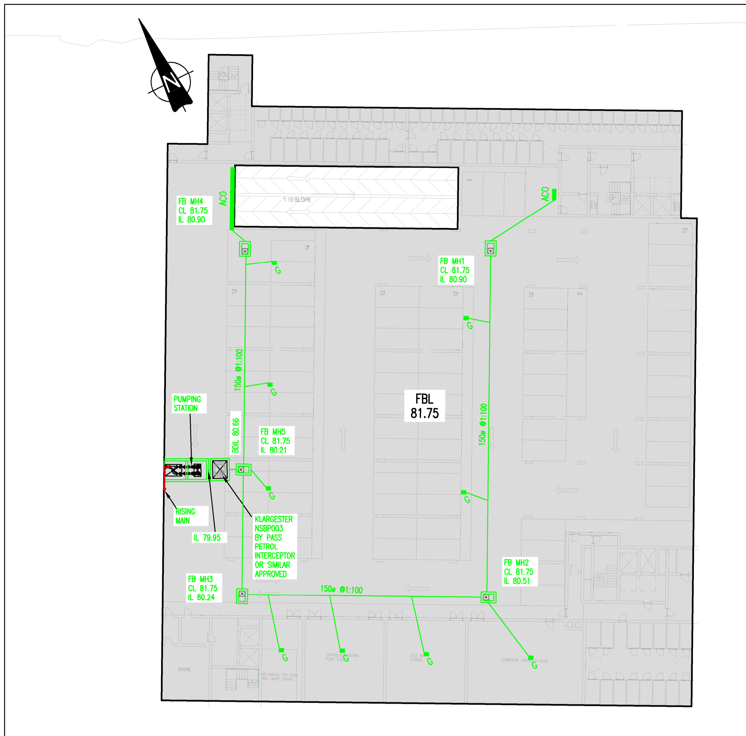
PLAN VIEW PROPOSED BASEMENT PUMPING STATION LAYOUT SCALE 1:250 @A1